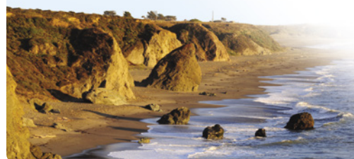
Sanoma County coastline

Day 4 > It's time to head north on Highway 101 through meandering rolling hills and a diverse landscape rich in agricultural heritage. Along the way, visit some of Sonoma County's best wineries along the river banks in the Russian River Valley and sample an array of exceptional wines. Hike the nature trail in Armstrong Redwoods State Reserve near Guerneville. North of picturesque Jenner-by-the-Sea stands Fort Ross State Historic Park, and farther north on the coast is Kruse Rhododendron State Reserve. Continuing north on scenic Highway 1 will lead you to explore numerous parks, beaches and coastal villages. Just north of the park a must see is Point Arena historic